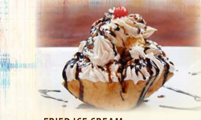
FRIED ICE CREAM - 5.99