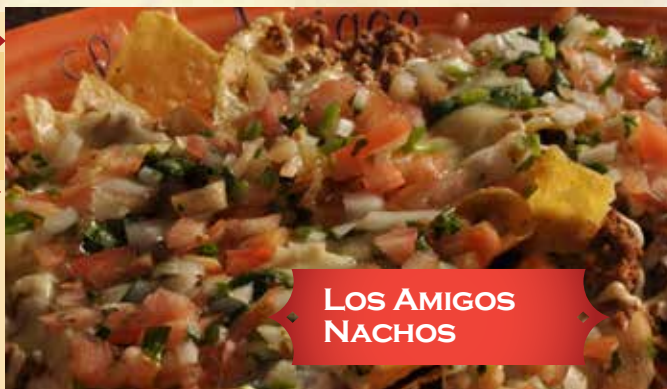
LOS AMIGOS NACHOS