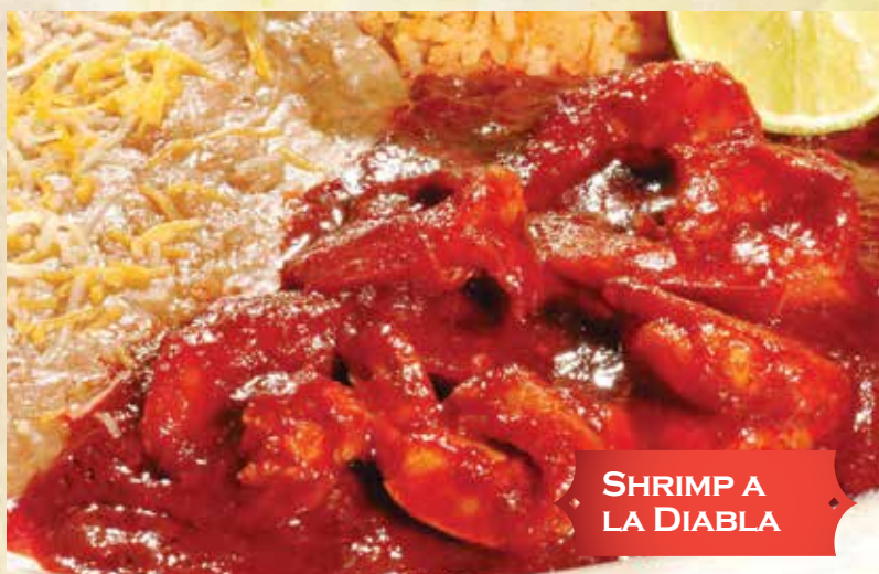
SHRIMP A LA DIABLA