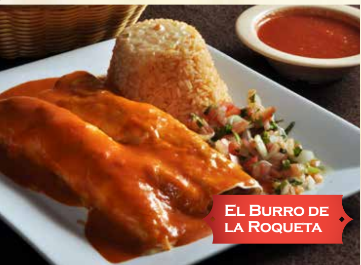
EL BURRO DE LA ROQUETA