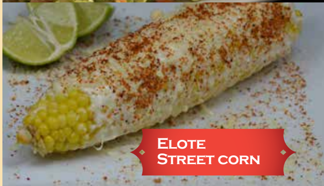
ELOTE STREET CORN