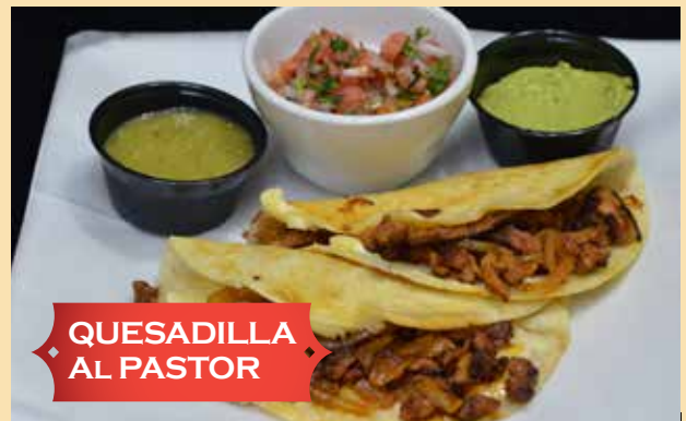
QUESADILLA AL PASTOR