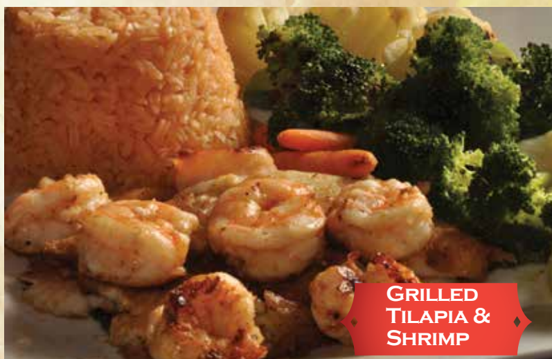
GRILLED TILAPIA & SHRIMP